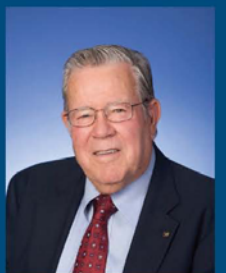
Division IV Edward C. Little