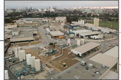
Edward C. Little Water Recycling Facility