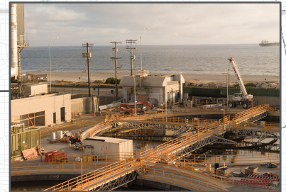
Hyperion Secondary Effluent Pump Station