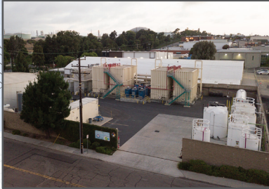
Chevron Nitrification Treatment Plant