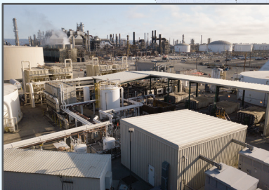
Torrance Refinery Water Recycling Plant