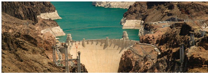
The Hoover Dam is part of the Colorado River system, located on the border of Nevada and Arizona.

Since West Basin began delivering wholesale imported water from the Colorado River in 1948, the District has provided a safe, secure, and cost-effective water supply to its service area.